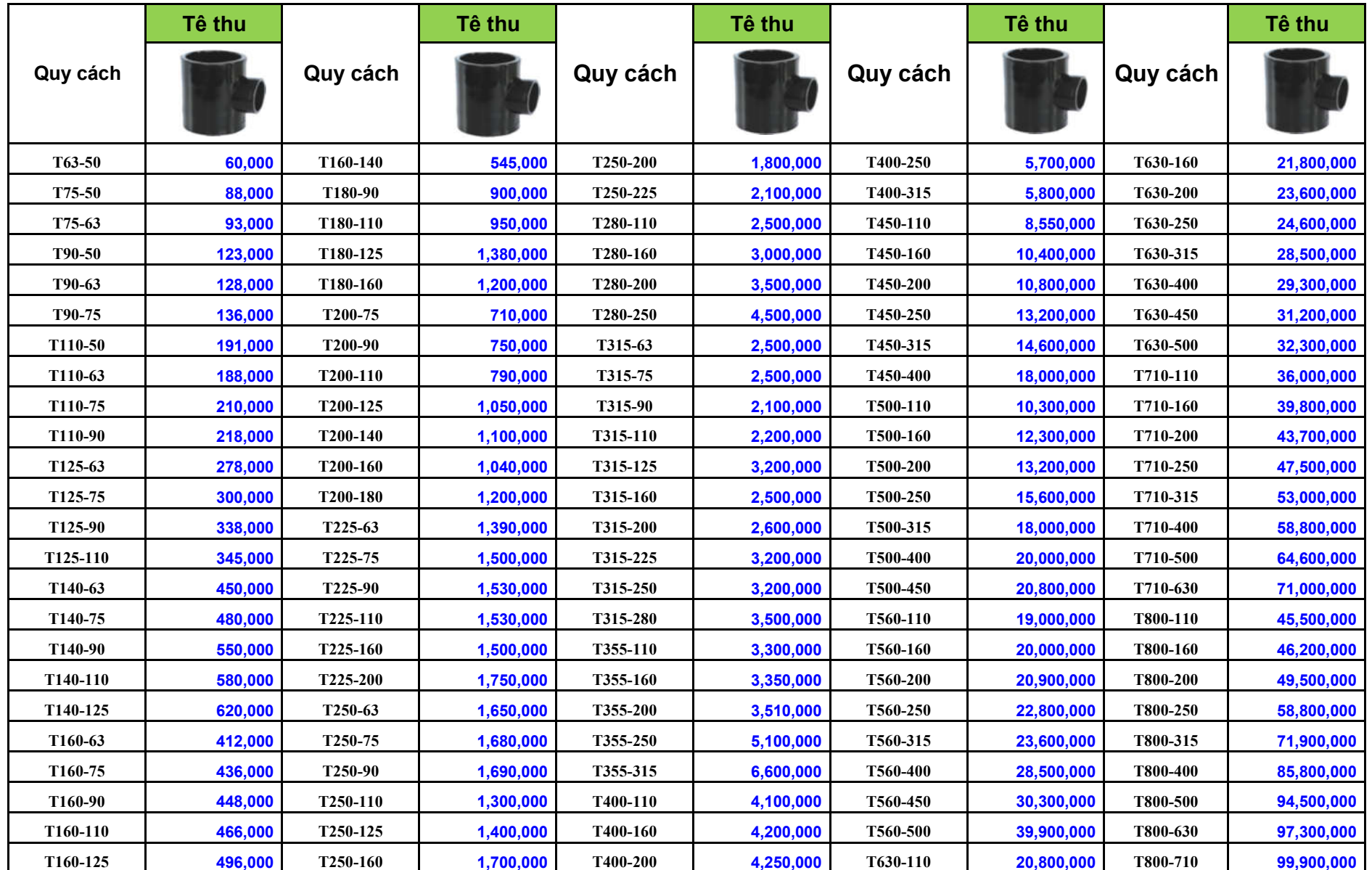
Bảng giá HDPE hàn đối đầu (Butt fusion)

Ghi chú : - Phụ kiện dùng cho áp lực PN 10.